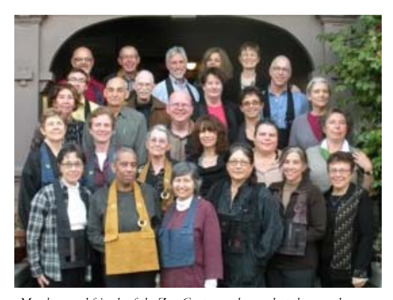
Members and friends of the Zen Center are honored at the second annual Legacy Circle Tea held in February.

There are many ways to extend financial support to your training and practice center at Great Dragon Mountain. The Development Fund listing to the right describes established funds and how financial support may be allocated within them.