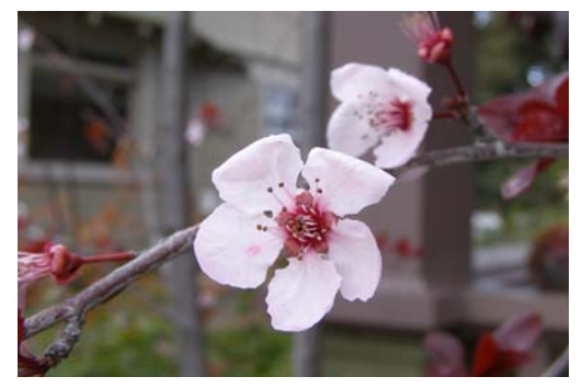
When the old plum tree blooms, the entire world blooms. ——Dogen Zenji

As strongly as we are urged on by these models of continuous practice, we are also held and sustained by the presence of this ceaselessness. It calls us into a bare presence, but even as we stand exposed, we rest in a simple and abiding being. At the same time that everything is being asked of us, everything is being offered. We are living anyway. Why not live fully?