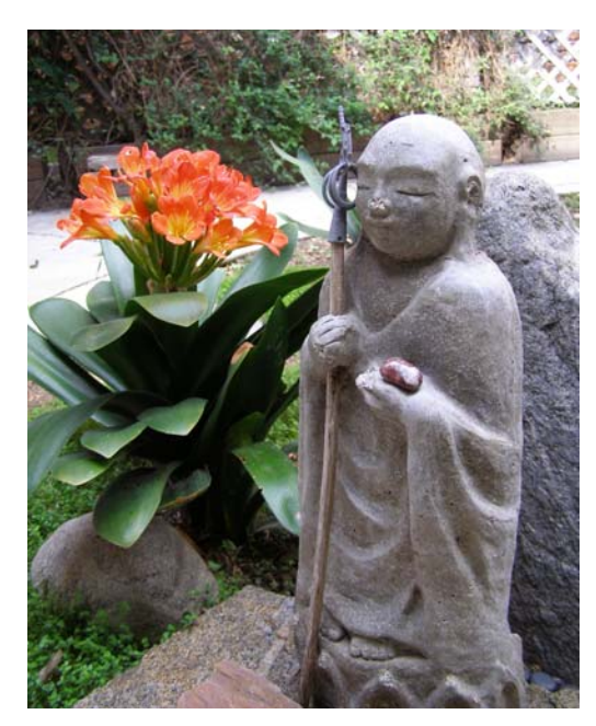
Jizo Bodhisattva, protector of wayfarers and travelers, manifests ceaseless practice through his Great Vow.

When what we call "life" is the same as what we call "practice," we can say that everything we do is practice, and yet we do not say that anything we do is practice. When we say that everything we do is practice, this is because we seek to call forth in ourselves a mind that is boundless, choiceless, and welcomes without distinction