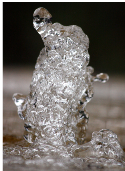
Every drop returns to the source.

The capping phrase above, “Not leaving Mara’s realm, enter the Buddha’s realm,” tells us that in this dualistic world of what appear to be contradictions and oppositions, we are being asked to take a broader view of things. Though there is only this One life, we do not see