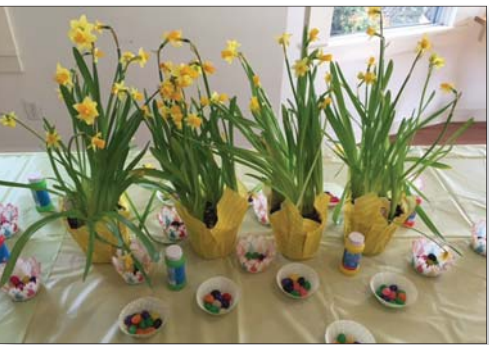
Table setting for Buddha's birthday by Reishin and True-Joy