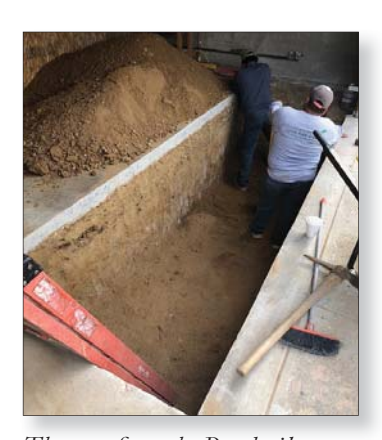
The retrofit to the Pundarika garages continues.