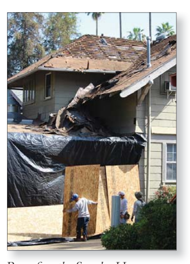
Reroofing the Sangha House.