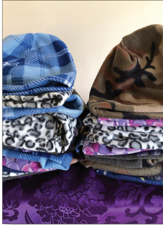
Making beanies for our unhoused neighbors.