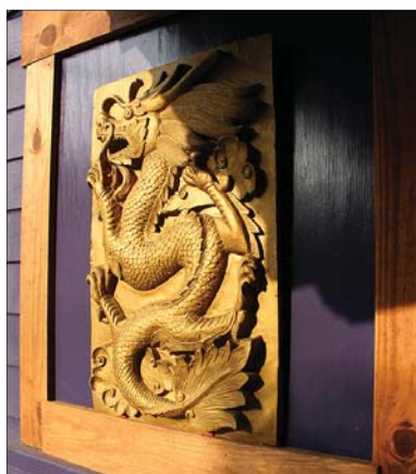
Dragon sculpture watching over the Buddha Hall.