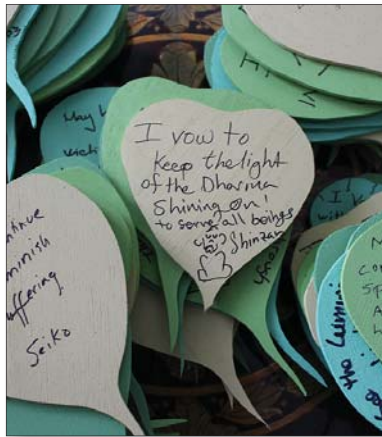
Vows waiting to be hung on the mural. You'll find blank leaves in the Dharma Hall to write your vow on.