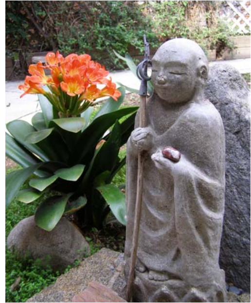
Jizo Bodhisattva, protector of wayfarers and travelers, manifests ceaseless practice through his Great Vow.