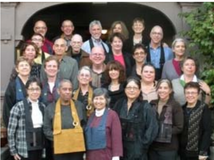
Members and friends of the Zen Center are honored at the second annual Legacy Circle Tea held in February.

There are many ways to extend financial support to your training and practice center at Great Dragon Mountain. The Development Fund listing to the right describes established funds and how financial support may be allocated within them. ■